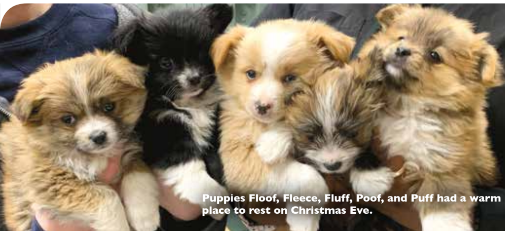
Puppies Floof, Fleece, Fluff, Poof, and Puff had a warm place to rest on Christmas Eve.

lifesavers in situations like this." Once her babies were puffy and weaned and Sugar was on a steady path to complete recovery, the Center announced through social media that the beloved sugar poms would begin their search for forever homes in early January. Dedicated adopters heard the call loud and clear and created a camp-out outside the Center's adoption village at 6 p.m. the evening before the poms would become