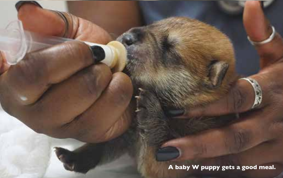
A baby W puppy gets a good meal.