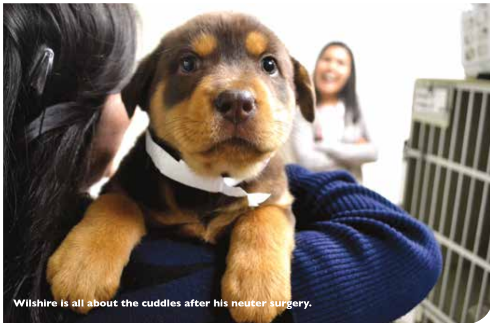
Wilshire is all about the cuddles after his neuter surgery.

You can help create more success stories like this one, donate at www.animalcenter.org . 🐾