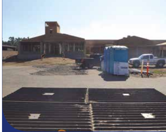
October 30, 2018, the walls and interior framing of the new building have been completed.

THE SKY'S THE LIMIT AS WE GO INTO 2019 WITH AN INCREDIBLE NEW ADOPTION CENTER WITH DOUBLE THE EXAM AND SURGERY SPACE AND INDOOR/OUTDOOR KENNELS.