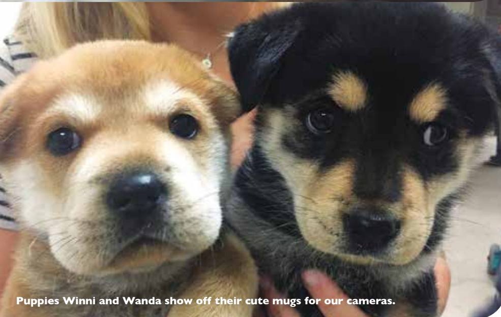
Puppies Winni and Wanda show off their cute mugs for our cameras.