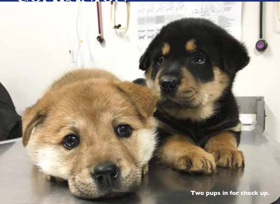
Two pups in for check up.