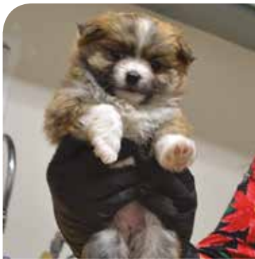
Sugar 'Mom' and Babies arrived at the Center just shy of Christmas Eve.

Helen Woodward Animal Center received a call about Sugar, a mother Pomeranian who had been hit by a car and suffered leg injuries. She and her puppies were in great need! Center staff and foster volunteers quickly stepped up.