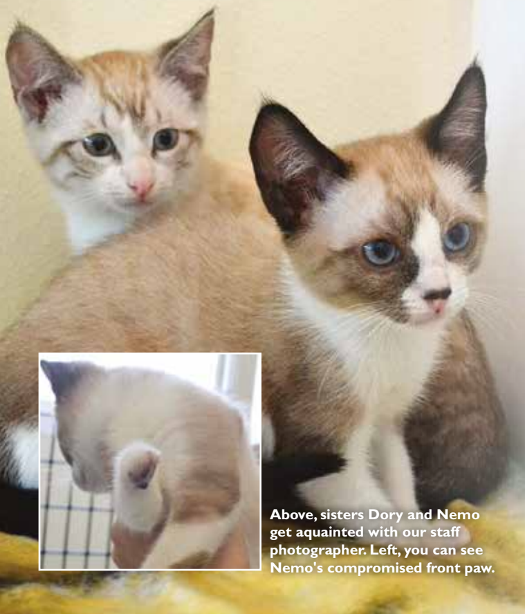
Above, sisters Dory and Nemo get acquainted with our staff photographer. Left, you can see Nemo's compromised front paw.

If you missed out on Nemo and Dory, don't worry, there are lots of fish in the sea (or should we say, cats in the cattery.) Visit animalcenter.org and search adoptable cats to find your new companion today. 🐾