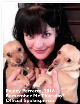
Pauley Perrette, 2016 Remember Me Thursday® Official Spokesperson

We are excited to announce the official spokesperson for the 2016 Remember Me Thursday® campaign, Pauley Perrette.