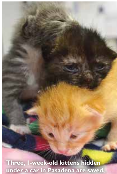
Three, 1-week-old kittens hidden under a car in Pasadena are saved,

He acted quickly to get them to his local shelter but unfortunately they lacked the resources to deal with newborns. Thankfully the rescue knew they could reach out to Helen Woodward Animal Center. Because of our extensive foster network, we would be able to provide the kittens with the round-the-clock feedings they desperately need.