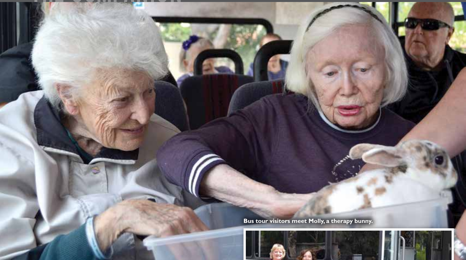
Bus tour visitors meet Molly, a therapy bunny.