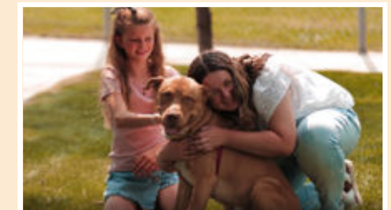
(Images from Helen Woodward Animal Center's "Thank You" Video, featuring One Voice Children's Choir, rescue pets from Utah Humane Society and Helen Woodward Animal Center, and the song "Thank You" by Celine Dion.)

Helen Woodward Animal Center shares this video as a message of thanks to those who continue to give of themselves in the ongoing battle to save the lives of orphan pets.