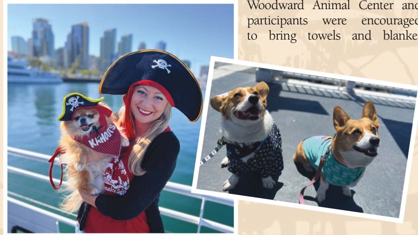
Pawticipants at City Cruises' Pet Day on the Bay supporting Helen Woodward Animal Center.

After a two year hiatus, animal lovers were able to gather their PAWrates and FURmaids and set sail on a voyage to save orphan pets! City Cruises' Pet Day on the Bay was back, April 23rd, to treat humans and their furry family members to a pet-friendly boat tour around the San Diego Bay. The adorable event supported the pets and programs at Helen Woodward Animal Center and participants were encouraged to bring towels and blanket