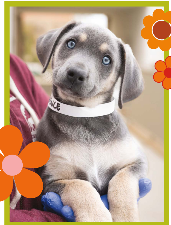
One of the puppies from Minky's litter.

It didn't take long for this sweet mom to accept the extra pair as her very own. Over the last several weeks, Minky has been nursing, cleaning and snuggling all five babies and getting them ready for adoption! 🐾