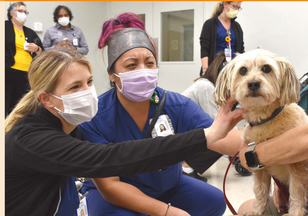
Sharp HealthCare staff meet Helen Woodward Animal Center PET animals during a recent therapy visit.