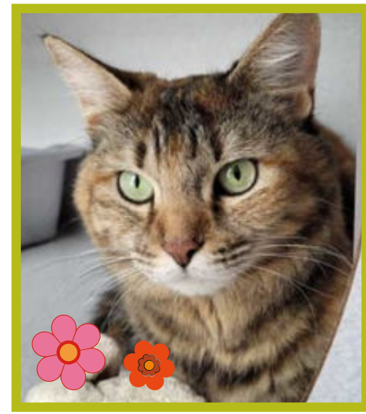
Bethany is a great mom.

Another recent mom to arrive at Helen Woodward Animal Center is Bethany. She was found in the Bakersfield area in a box with her three babies by a good Samaritan who brought her home. Hoping to find her a quiet spot away from the family dog, her rescuer placed her in the garage but she made her way to the attic, taking her kittens with her. Our rescue partner got wind of the situation and came to her aid. After a search of the attic, the entire family was found and