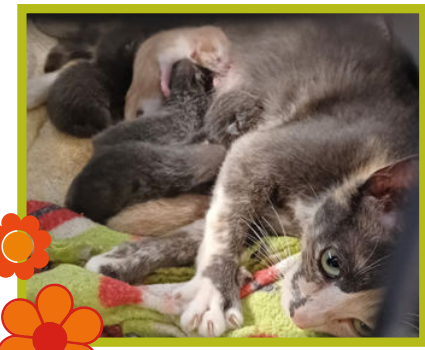
Lyon nurses her kittens.

Spring in the animal center world means the arrival of kitten season. The warming temperatures welcome a slew of new babies and Helen Woodward Animal Center becomes a kitten nursery crawling with critters in need of our specialized care.