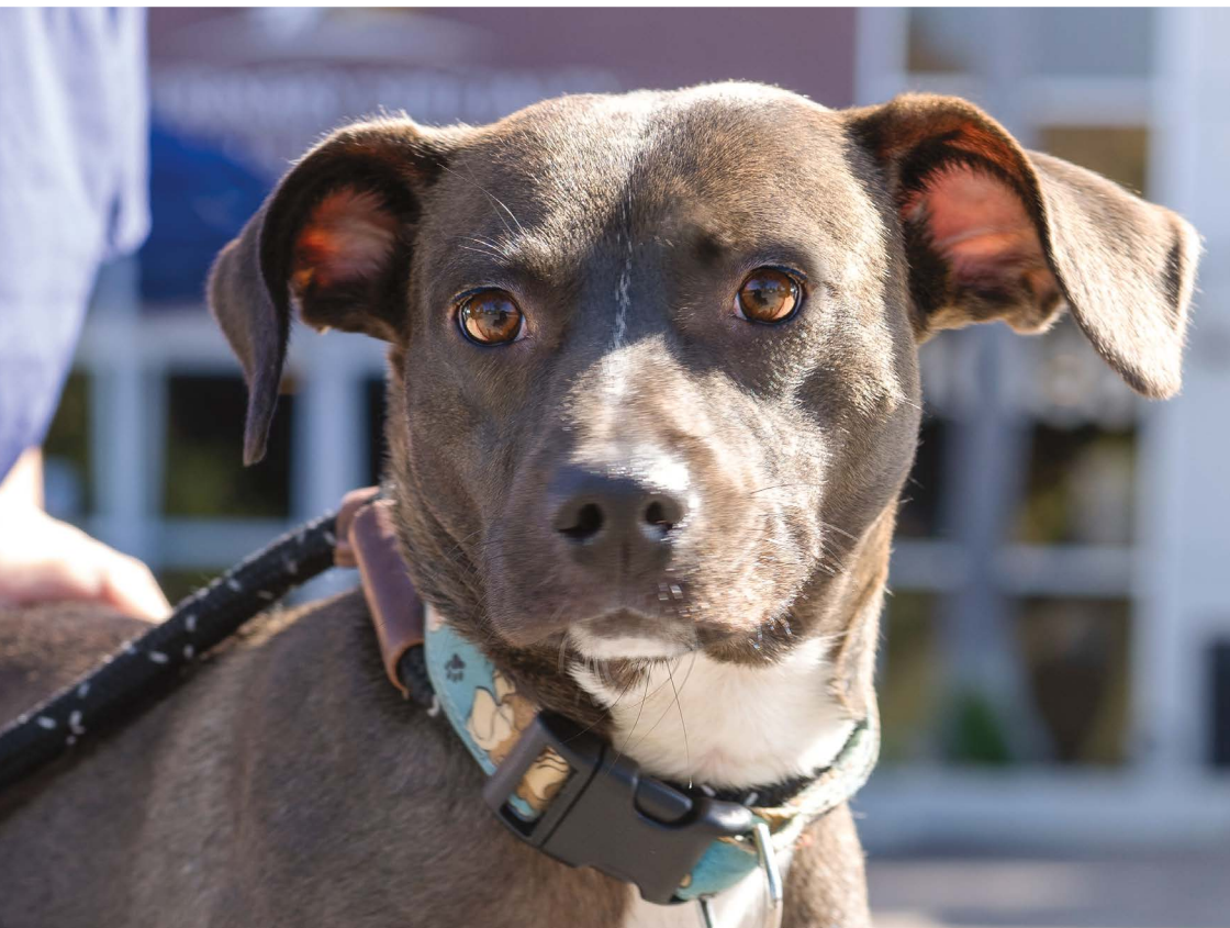
Hope arrives at Helen Woodward Animal Center where she gave birth to a litter of puppies after being found as a stray in Calexico.