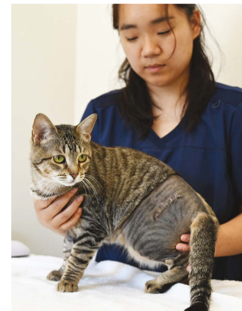
Helen Woodward Animal Center medical staff monitor Betty's recovery progress after her surgery.

Despite a difficult start to life, Betty is now back on four paws, and her playful and loving personality is shining brightly through. Because of supporters like you, Betty's recovery was possible – and a future with the lucky family who adopts her is in sight. 🐾