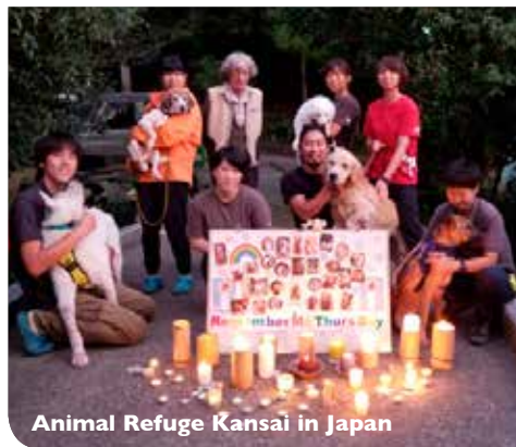
Animal Refuge Kansai in Japan