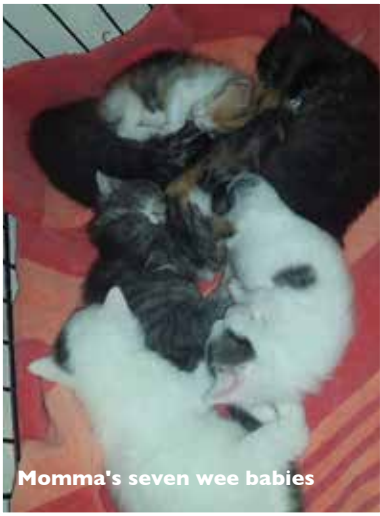
Momma's seven wee babies

Momma Who is responding well to treatment and will continue her recovery in a loving foster home until she's ready to begin her search for a forever home. 🐾