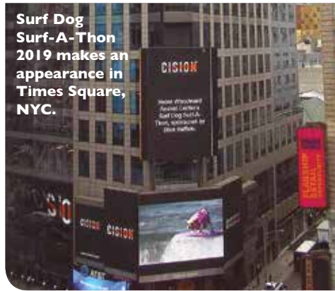
Surf Dog Surf-A-Thon 2019 makes an appearance in Times Square, NYC.