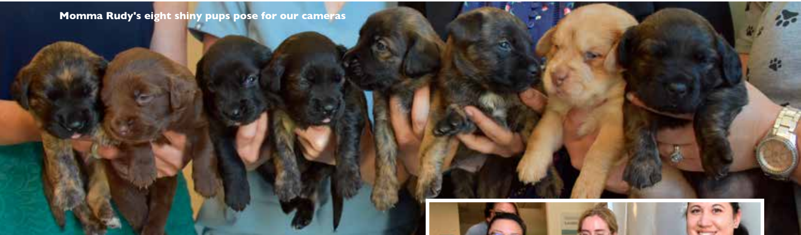
Momma Rudy's eight shiny pups pose for our cameras

#GIVINGTUESDAY, A GLOBAL DAY OF GIVING, TOOK PLACE ON DECEMBER 3RD. DONORS LIKE YOU HELPED US SAVE THE LIVES OF MORE PRECIOUS DOGS AND CATS THAN EVER BEFORE, BUT THERE IS STILL WORK TO BE DONE. IT'S NOT TOO LATE TO MAKE YOUR YEAR END CONTRIBUTION AND HELP MORE ANIMALS LIKE THESE ORPHANS IN OUR CARE.