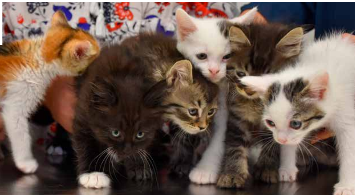
All seven kittens growing strong at their recent Center check up

PLEASE HELP US – ESPECIALLY AT THIS TIME OF YEAR – NO GIFT IS TOO SMALL! DONATE TODAY BY VISITING ANIMALCENTER.ORG/DONATE