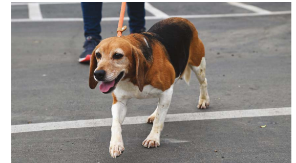
Some beagles were able to relax and enjoy walking around.

Animal rescue organizations from California, Wyoming, and Texas were among the first to open their doors to the 4,000 canines. Helen Woodward Animal Center was one of just two California organizations to be a part of the first stage of this incredible life-saving mission.