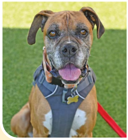
TYSON Boxer Blend

I am a very friendly and loving cat. I'm cautious in new environments, but once I feel at home I will be seeking your attention and wanting to cuddle in your lap. I am easy-going and will do well in a variety of households with kids and other pets.