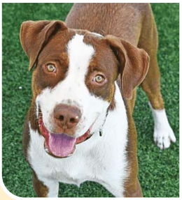
LUKA Australian Cattle Dog Blend

Hello! I am shy at first but it doesn't take long for my sweet and cuddly side to shine through. I like to lounge, but I also love my toys and can't wait to have a family to play with. Come visit me!