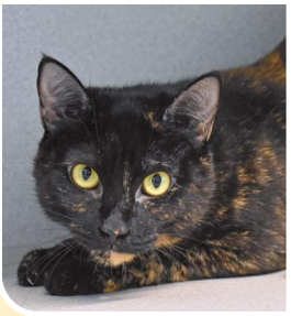
MIRIAM Domestic Short Hair Blend

Hello! I am shy at first but it doesn't take long for my sweet and cuddly side to shine through. I like to lounge, but I also love my toys and can't wait to have a family to play with. Come visit me!