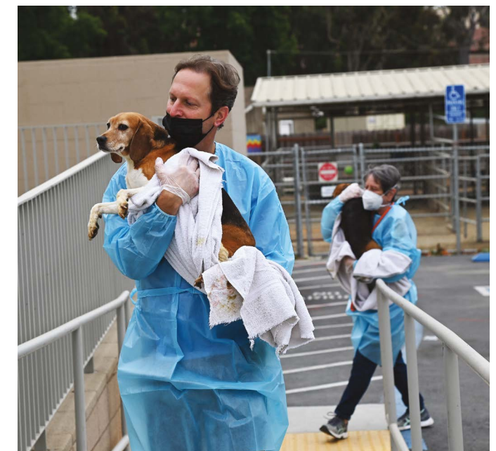
Volunteers help carry the beagles to begin the intake process.

One by one, each beagle is moving onto bigger and brighter futures with their forever families. Before coming to the Center, they had never been on grass or even been given a toy. Today, with thanks to the Center and all who support us, they are learning the meaning of love. 🐾