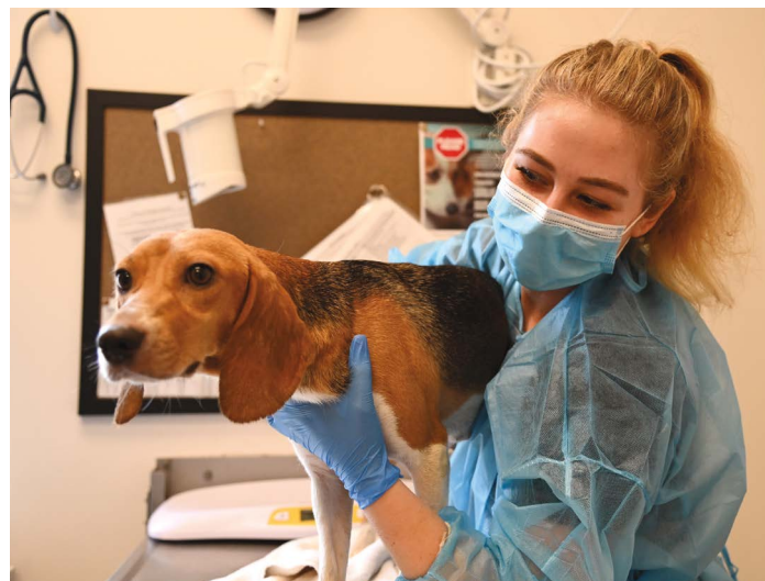
Earl Grey receiving her initial medical exam before heading to her foster home.

This rescue mission is part of the Humane Society of the United States' 'largest operation ever.' A seventh month investigation by the U.S. Department of Agriculture found over 70 Animal Welfare Act violations at the Virginia facility named Envigo. The disturbing conditions included dogs being kept in unsafe temperatures and unnecessarily euthanized, some without anesthesia.