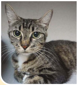
AISHA Domestic Short Hair Blend

Hello! I absolutely love attention and being pet. Plus, I will make a great adventure partner! I can't wait to play with you and become your best friend forever. I look forward to meeting you!