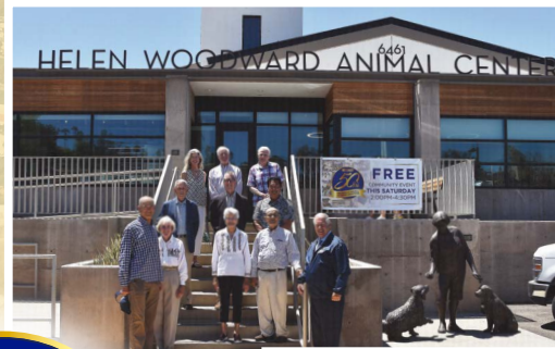
Board members in front of the Helen Woodward Animal Center's Adoptions Building.

The Center opened its doors to its neighbors that afternoon with crafts, games and animal encounters for the community, as well as a tour of the facilities. We were proud to see over 100 guests join us to celebrate our role serving the people and pets of San Diego. 🐾