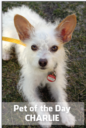
Pet of the Day CHARLIE