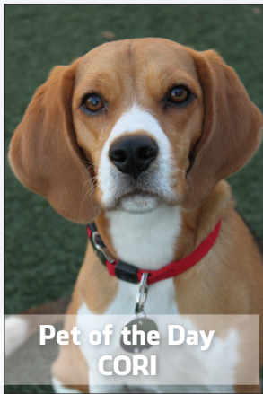
Pet of the Day CORI