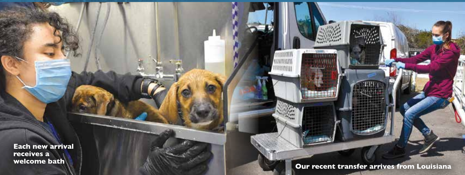
Each new arrival receives a welcome bath