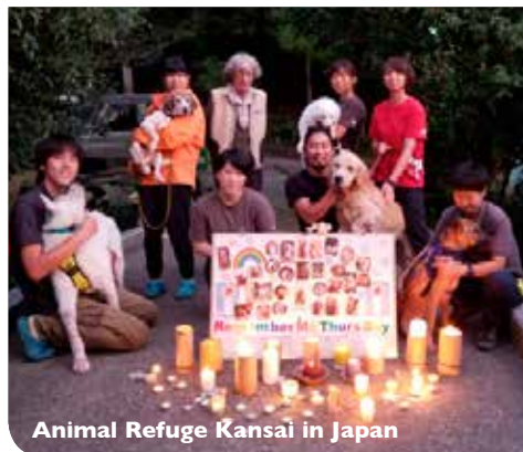
Animal Refuge Kansai in Japan