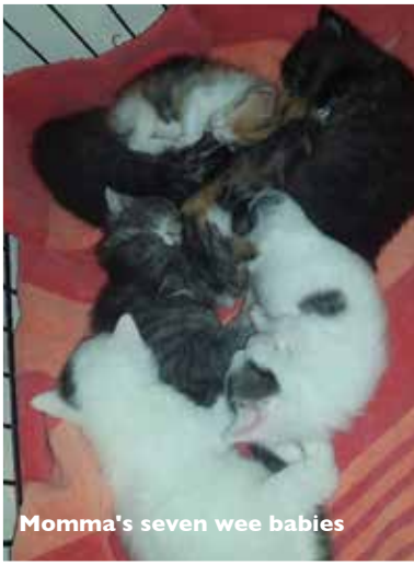
Momma's seven wee babies

Momma Who is responding well to treatment and will continue her recovery in a loving foster home until she's ready to begin her search for a forever home. 🐾