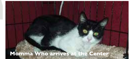
Momma Who arrives at the Center

We immediately made call outs to our foster