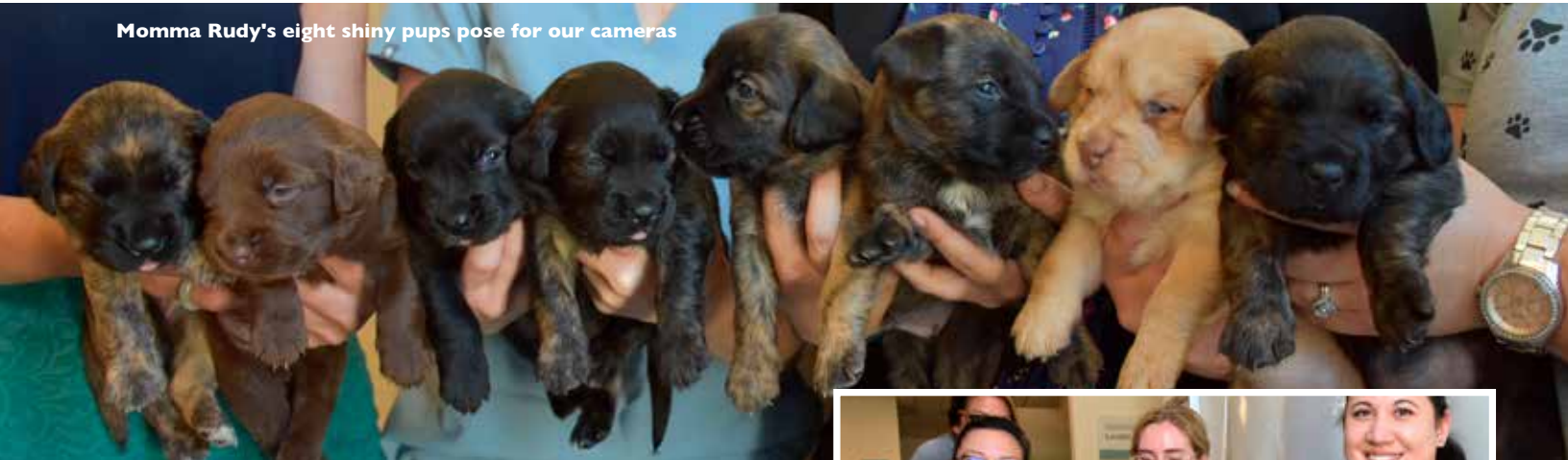
Momma Rudy's eight shiny pups pose for our cameras

#GIVINGTUESDAY, A GLOBAL DAY OF GIVING, TOOK PLACE ON DECEMBER 3RD. DONORS LIKE YOU HELPED US SAVE THE LIVES OF MORE PRECIOUS DOGS AND CATS THAN EVER BEFORE, BUT THERE IS STILL WORK TO BE DONE. IT'S NOT TOO LATE TO MAKE YOUR YEAR END CONTRIBUTION AND HELP MORE ANIMALS LIKE THESE ORPHANS IN OUR CARE.