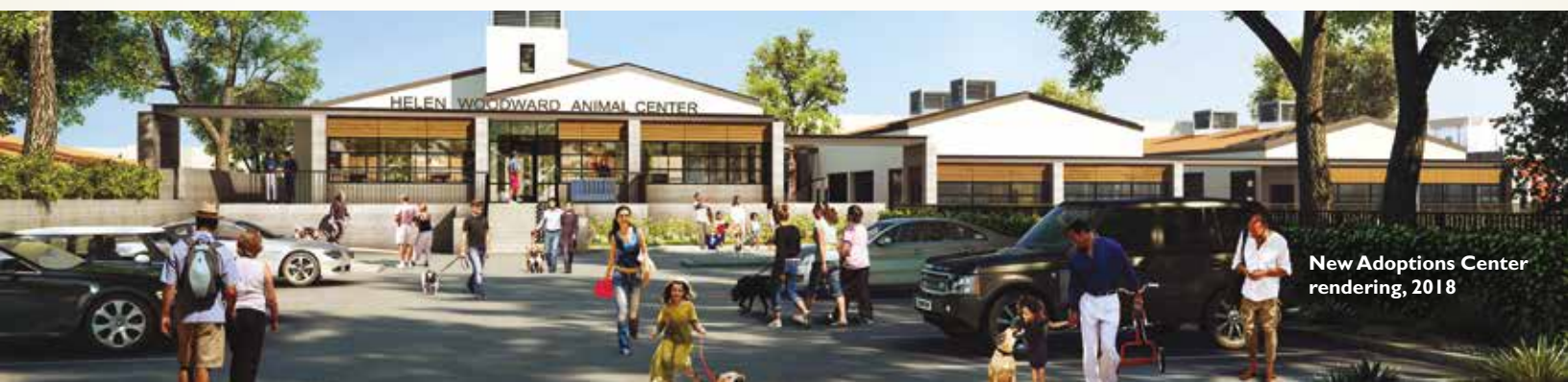
New Adoptions Center rendering, 2018