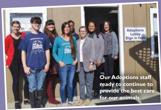
Our Adoptions staff ready to continue to provide the best care for our animals

In the meantime, the Center has created an Adoptions Village on-site to ensure that we continue to meet our Adoptions goals even in the midst of construction. By utilizing our old Education house, we have been able to transform the space with a sustainable area for our adoptable pets, including temporary kennels for dogs and an indoor area for cats.