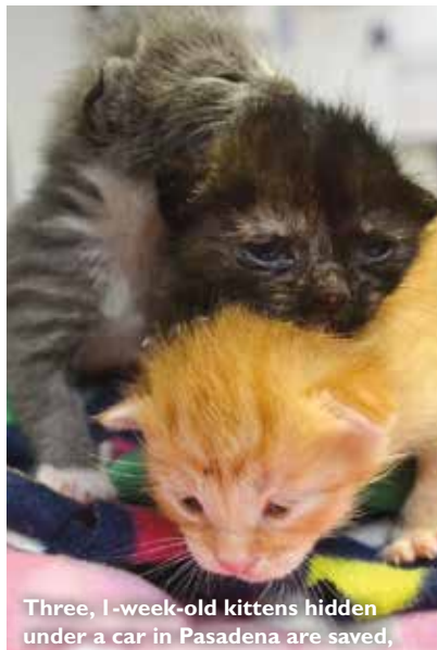
Three, 1-week-old kittens hidden under a car in Pasadena are saved,

He acted quickly to get them to his local shelter but unfortunately they lacked the resources to deal with newborns. Thankfully the rescue knew they could reach out to Helen Woodward Animal Center. Because of our extensive foster network, we would be able to provide the kittens with the round-the-clock feedings they desperately need.