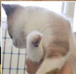
Above, sisters Dory and Nemo get acquainted with our staff photographer. Left, you can see Nemo's compromised front paw.

If you missed out on Nemo and Dory, don't worry, there are lots of fish in the sea (or should we say, cats in the cattery.) Visit animalcenter.org and search adoptable cats to find your new companion today. 🐾