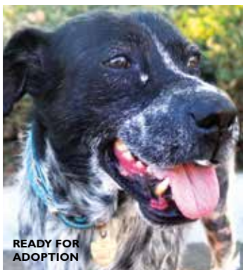
READY FOR ADOPTION

Since his arrival at Helen Woodward Animal Center in early May, Dwayne, an orphan pup who had been horribly disfigured by abuse, has been living a true Cinderella story. Thanks to the media, Dwayne's tragic early life (subjected to kicking, beatings, and a crude wire muzzle), and his Tijuana rescue have become news throughout the world, leading