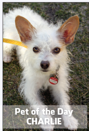
Pet of the Day CHARLIE