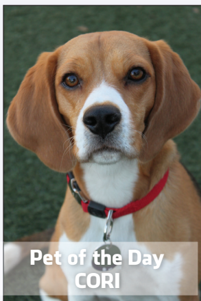
Pet of the Day CORI