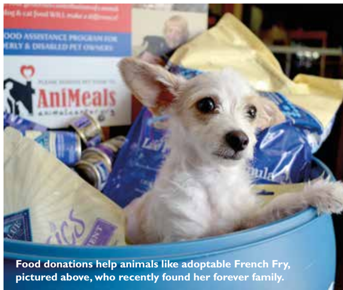
Food donations help animals like adoptable French Fry, pictured above, who recently found her forever family.

Special thanks to our agency partners as well as our corporate partners at PETCO, Gelson's and Kahoots for helping us to bring this gift to so many in need. 🐾