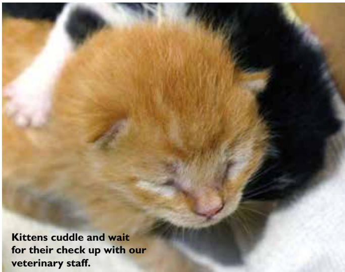
Kittens cuddle and wait for their check up with our veterinary staff.